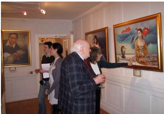
Visitors take in the paintings

(Clearwisdom.net) On February 3, 2010, the International Truthfulness-Compassion-Forbearance Art Exhibition held its opening ceremony at the Hampstead Museum in Burgh House. This was the third time that the exhibition has come to London. A total of 16 paintings were presented to show the beauty of Truth-Compassion-Forbearance and to depict the brutal persecution of Falun Gong in China.