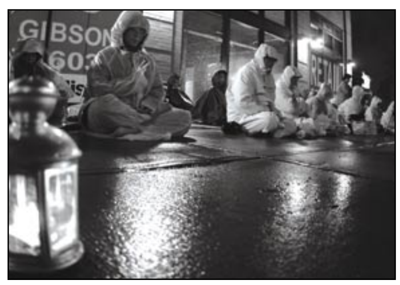
Candlelight vigils have marked dire moments in China, such as mass arrests and killings. Demonstrators sometimes sit all night.

voices seems to be recognizing tributed to community service the cause.