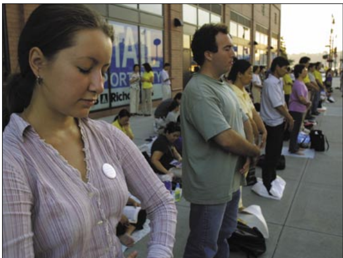
Opposite the Chinese Consulate on 42nd Street, New Yorkers silently protest suppression of their meditation group in China, Falun Gong. They have demonstrated weekly for five years.