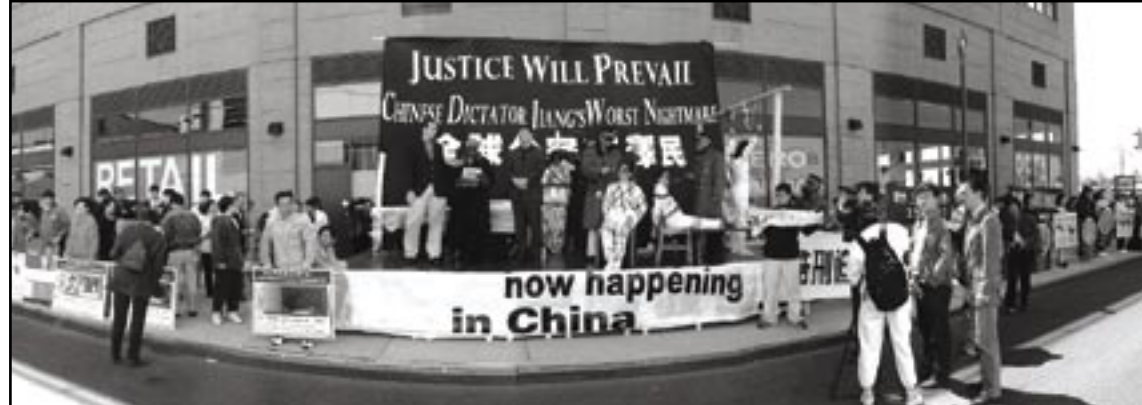
As part of a demonstration opposite the Chinese Consulate, participants perform a mock trial of Jiang Zemin for crimes against humanity.