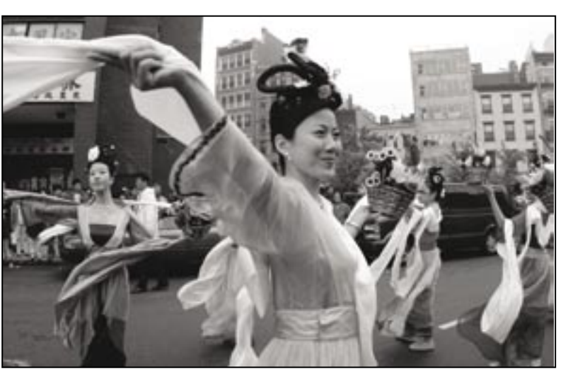
Parades have been one of many forms of community involvement.