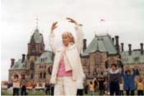
Parliament Hill, Ottawa, Canada, October, 1999

Over 100 million people in 40 countries practice Falun Dafa. Falun Dafa helps practitioners to improve their health, to purify their mind, to uplift their spirit, and to deepen their understanding of life, humanity, and the universe.