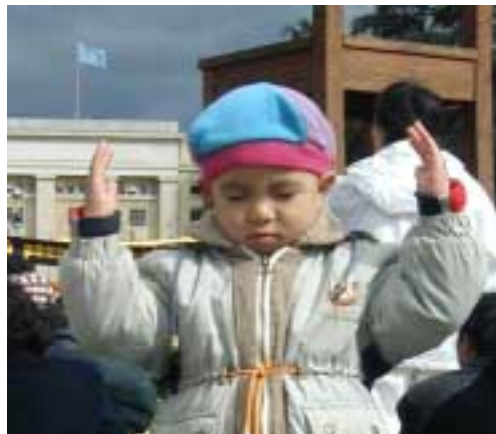
Geneva, March 20, 2001.