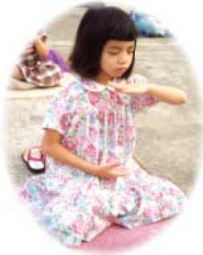
Dallas, Texas, USA, 1999