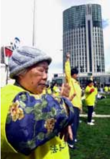
Practitioners from Australia practice silently outside the Asia-Pacific Economic Summit 2000 at the Crown Casino Hotel raising the concern to China's crackdown on Falun Dafa to the international community. Melbourne, Australia, September, 2000.