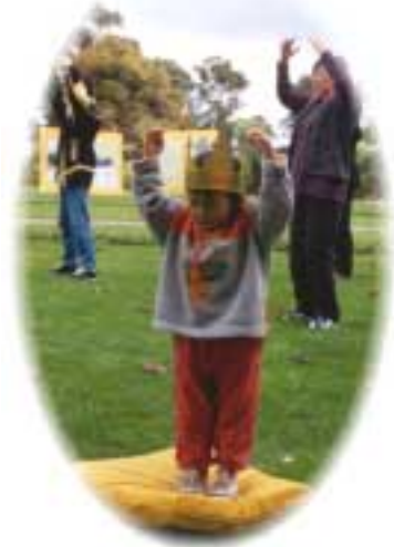
New Zealand, May, 2000