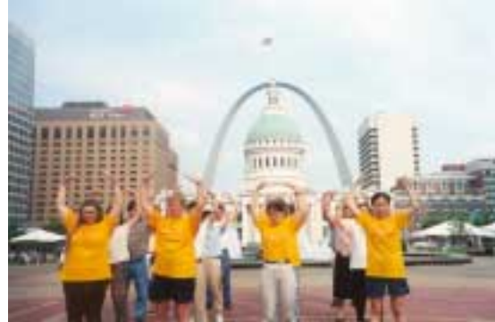
St. Louis, MO, USA, May, 2000.