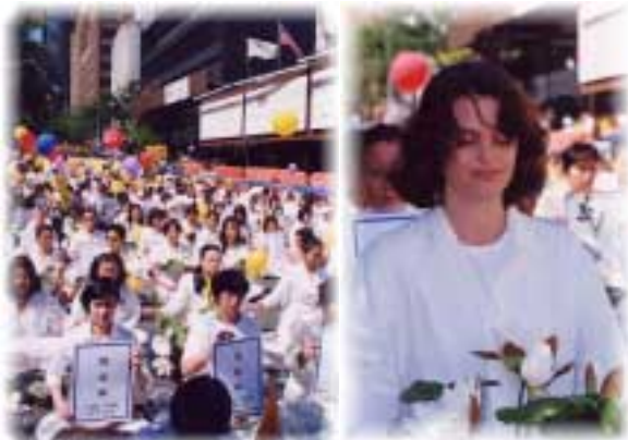
Memorial Ceremony held at the Dag Hammarskjöld Plaza in front of the U.N. Building to remember the 50 practitioners who were tortured to death in China.