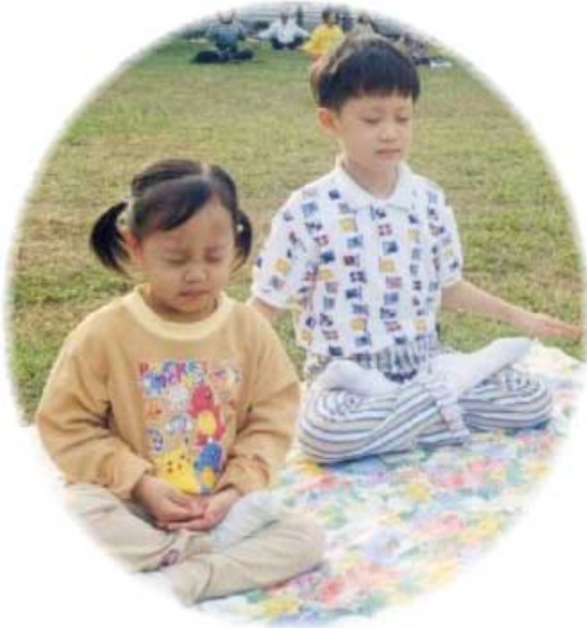
Taiwan, Taipei, 1999