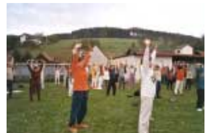
Gutersbach, Germany, 1999.