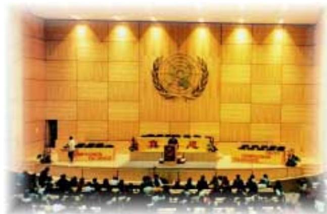
Falun Dafa Experience Sharing Conference, United Nations, Geneva, Switzerland, September, 1998.