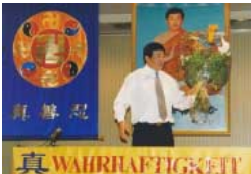
In Frankfurt, Germany, 1998.