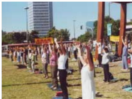
Practitioners appeal to the United Nations in Geneva, Geneva, Switzerland, March, 2000.