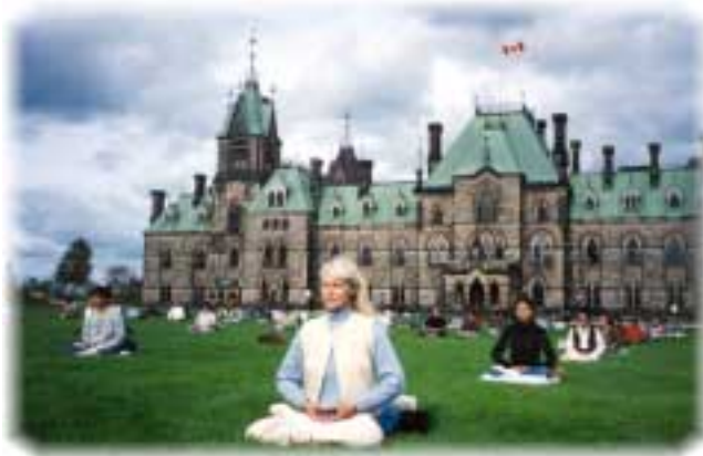
Practitioners from different cities of Canada gather and practice in front of the Parliament Hill, to urge the Canada government to speak out on China's persecution of Falun Dafa, Ottawa, Canada, October, 1999.