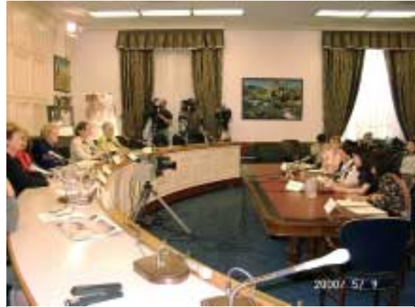
Some detained Falun Gong practitioners spoke at the US Congress hearing regarding the women's persecution, Washington, DC, US, May 9, 2000.