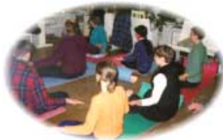
Riga, Latvia, February, 2000.