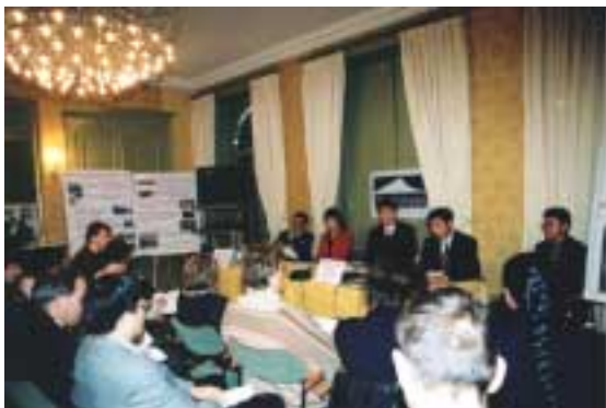
Press conference in Geneva during the 56th United Nation Commission on Human Rights, Geneva, Switzerland, March 20, 2000.