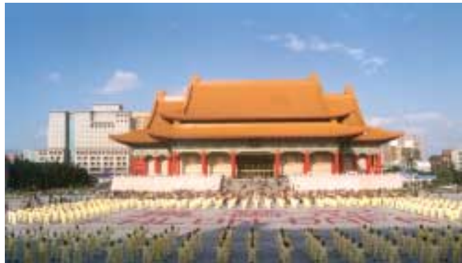
Taipei, Taiwan, 1999.