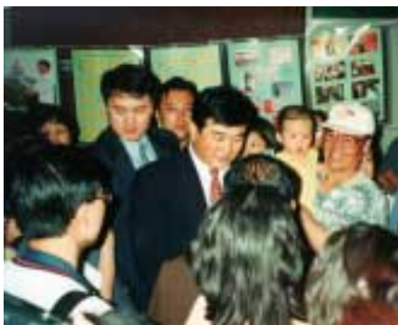
Meeting with the local practitioners, Canada, 1998

In 1994, Mr. Li started his teaching in Sweden which is the first country he visited outside China. Since then, Li has traveled all over the world to lecture, on invitation, at Falun Dafa conferences. Throughout the course of these engagements, Li has continued his ways, refusing to accept any money or donations for his work. He has lectured in countries as diverse as Australia, Canada, Germany, New Zealand, Hong Kong, Singapore, Switzerland, Taiwan, and the United States. Any Falun Dafa activity is completely without charge and open to anyone interested. This is unprecedented and bespeaks of Li's selfless aspirations.