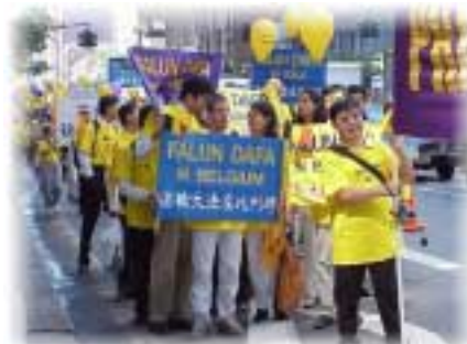
Peaceful march from Chinese Mission to United Nations to tell people the truth of Falun Dafa in China.