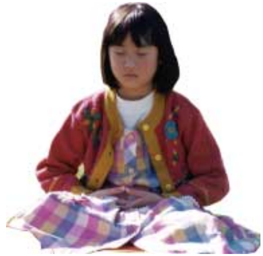
Sydney, Australia, May, 2000