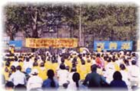
Press near the U.N to appeal to kind-hearted people to help resolve the crisis on Falun Dafa in China.

As the leaders of 188 countries were attending the United Nations Millennium Summit on September 6-8, 2000, in New York City, Falun Dafa practitioners from USA and other regions around the world gathered in New York City. They hope more and more people from the governments of all nations, international human rights organizations, international institutions, and news media can together help to call on Chinese government to stop its inhuman persecution against Falun Dafa and to release all jailed Falun Dafa practitioners.