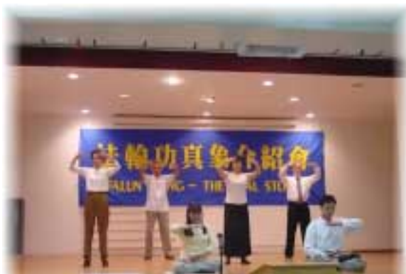
The first public conference on "the Truth of Falun Gong and Freedom of Belief in China" was held at the Chinese Public Hall in Manhattan Chinatown of New York City, July 22, 2000,