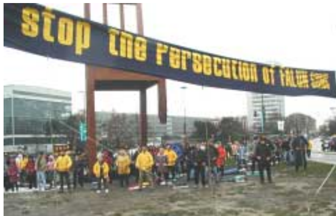
Over 1000 practitioners from 20 countries practice in front of the United Nation to appeal to the 57th United Nation Commission on Human Rights, Geneva, March 19, 2001.