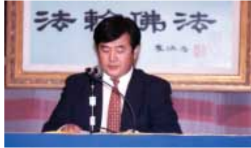
In New York City, USA, 1998.