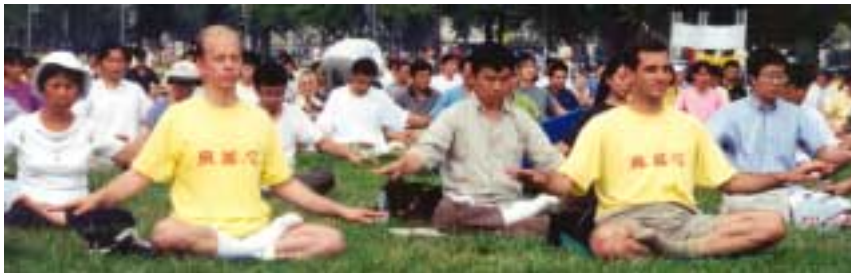
Washington DC, USA, July, 1999