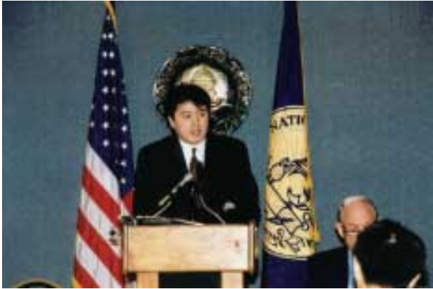
Erping Zhang, Falun Gong spokesman spoke at the US National Press Club, April 8, 2000.