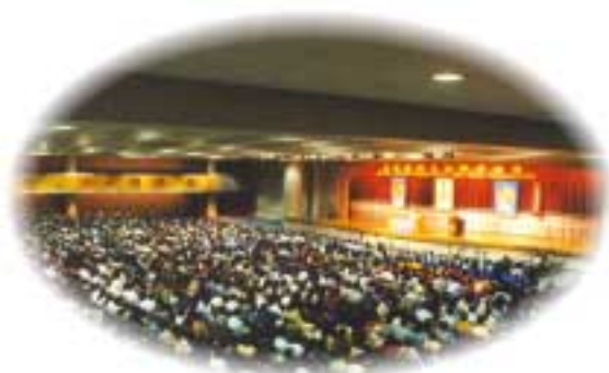
New York City Falun Dafa Experience Sharing Conference, Javits Center, New York, USA, March 1998.

“Dafa (The Great Law) is being spread far and wide. Those who hear about it are looking for it. Those who have obtained it are delighted with it. The number of cultivators is increasing daily and becoming innumerable.” - Mr. Li Hongzhi, December 8, 1995.