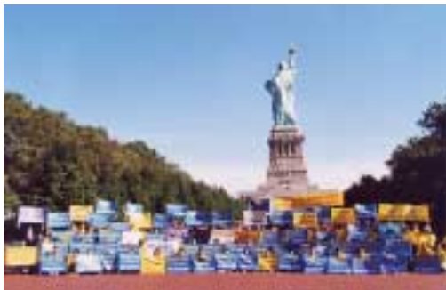
Practitioners from all over the world, demonstrate Falun Dafa movements in front of the statue of Liberty, Ellis Island.

As the leaders of 188 countries were attending the United Nations Millennium Summit on September 6-8, 2000, in New York City, Falun Dafa practitioners from USA and other regions around the world gathered in New York City. They hope more and more people from the governments of all nations, international human rights organizations, international institutions, and news media can together help to call on Chinese government to stop its inhuman persecution against Falun Dafa and to release all jailed Falun Dafa practitioners.