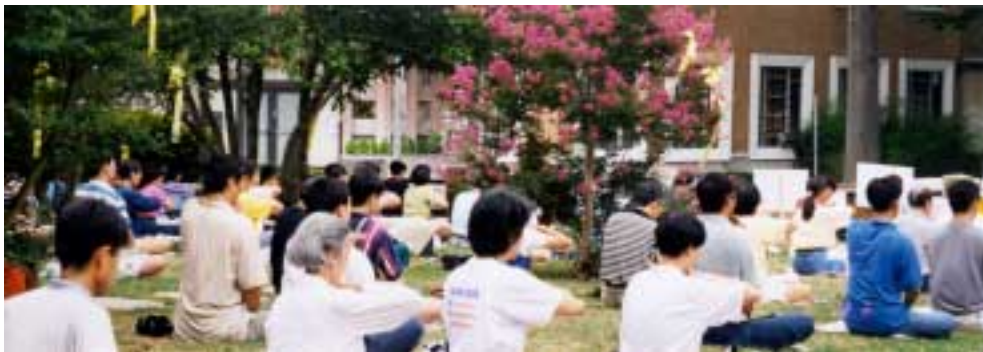
Practitioners from USA practice in front of the Chinese Embassy to appeal to the Chinese Government, Washington DC, USA, July, 1999.