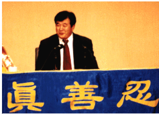
In Sydney, 1999