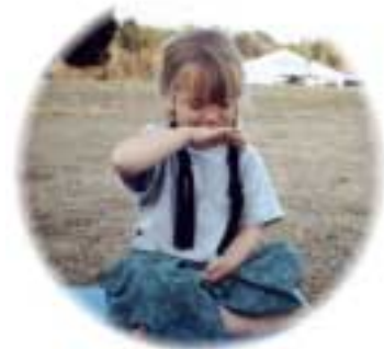
4-year-old girl meditating, Florida, USA, June, 2000