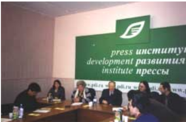
Russian Falun Gong practitioners successfully held a Russian Falun Dafa Truth Story Press Conference, February 22, 2001.

Mr. S. A. Kovaliov, an influential parliamentarian of Duma in Russia and in the world, and the Chair of the Human Rights Commission of Duma, attended the press conference in person. He said: "... I doubt the legitimacy of the Chinese government's persecution of this spiritual movement very much. Such things are absolutely not allowed in Russia..."