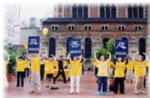
Appeal to President Jiang Zemin of China to stop the persecution of Falun Dafa, Waldorf Hotel, Manhattan.