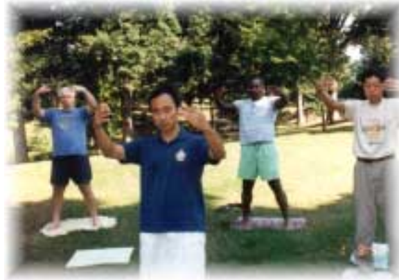
Durham, North Carolina, USA, August, 1998.

“Falun Dafa transcends cultural and racial boundaries. It resonates the universal truth to every corner of the earth and bridges the gap between east and west. “ - Robert C. Lanier, Mayor of Houston, the proclamation of “Li Hong Zhi Day” in Houston on October 12, 1996.