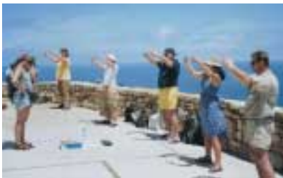
Cape of Good Hope, South Africa, August, 1999.