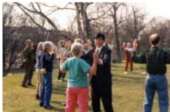
Teaching in Sweden, 1994.