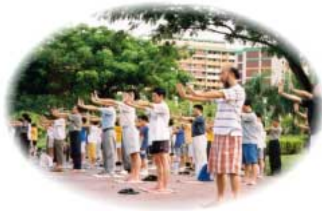
Singapore, May, 2000