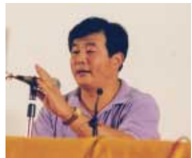
In Singapore, 1998