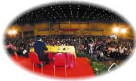
Singapore Falun Dafa Experience Sharing Conference, the World Trade Center, Singapore, August, 1998.