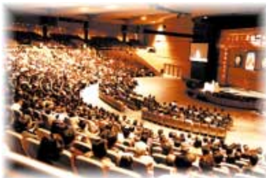
Australia Falun Dafa Experience Sharing Conference, International Conference Center, Sydney, Australia, May, 1999.