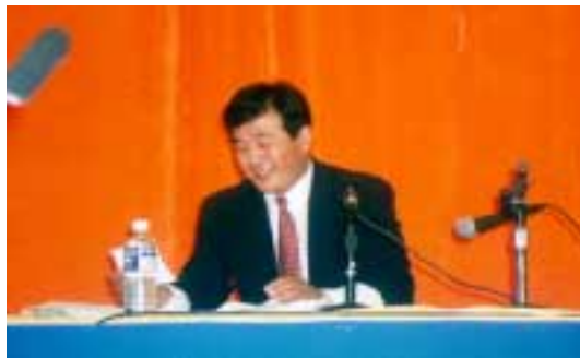
In Toronto, Canada, 1998.