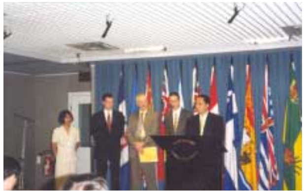
Canada Falun Gong practitioners held a Press Conference to ask for the worldwide support to stop China's crackdown on Falun Gong, Ottawa, Canada, July 20, 2000.