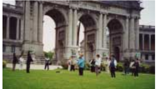
Brussels, Belgium, 1999