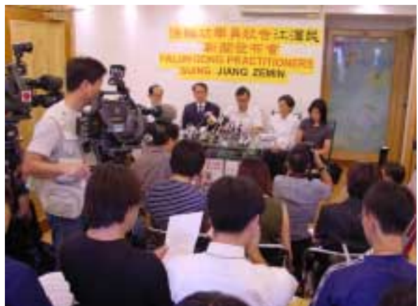
"Falun Gong practitioners suing Jiang Zemin" Press Conference was held in Hong Kong on October 9, 2000.

Mr. S. A. Kovaliov, an influential parliamentarian of Duma in Russia and in the world, and the Chair of the Human Rights Commission of Duma, attended the press conference in person. He said: "... I doubt the legitimacy of the Chinese government's persecution of this spiritual movement very much. Such things are absolutely not allowed in Russia..."