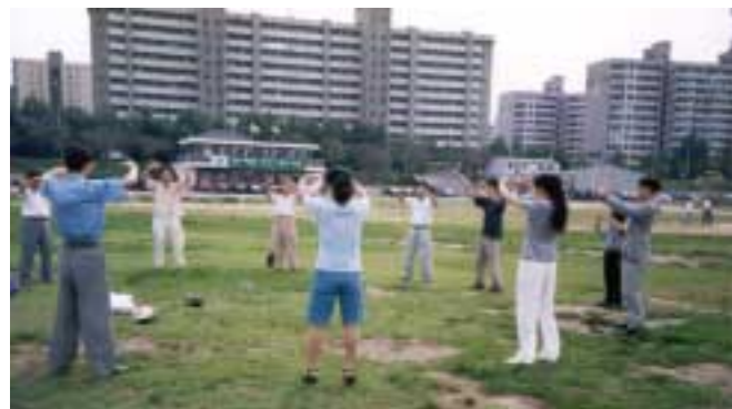
Seoul, Korea, 1999.