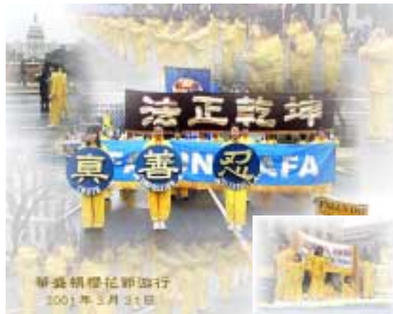
Practitioners in the Cherry Festival Parade in Washington DC on March 31, 2001.