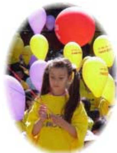
The pure hope