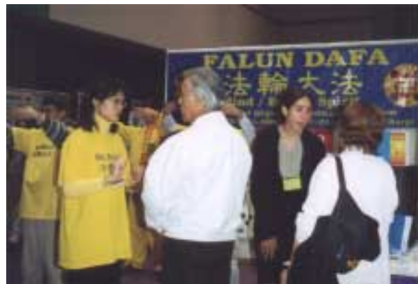
A "Falun Gong Truth-clarifying Picture Display" was held in L.A. City Hall mall to tell the truth to the city officers, L.A. USA, December 25, 2000.