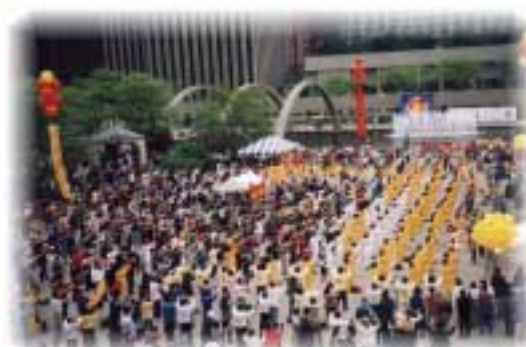
Ceremony to celebrate the seventh anniversary of Falun Dafa, City Hall Plaza, Toronto, Canada, May, 1998.