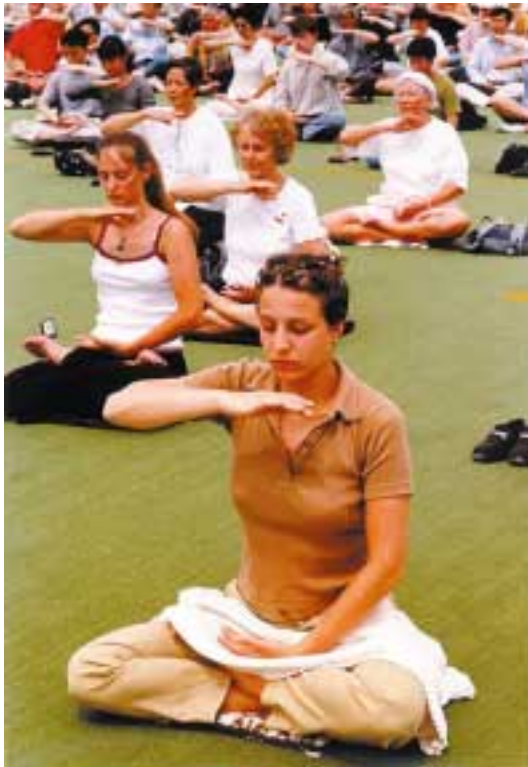
Paris, France, 1998.

At the core of Falun Dafa are the principles of Truthfulness, Compassion, and Forbearance ( Zhen, Shan, Ren ). Practitioners of Falun Dafa strive to live by these principles at every moment, under every circumstance, always improving their moral nature. In turn, they receive remarkable health benefits. When the heart is pure, the mind balanced, and the body energized, health and happiness occur naturally. Individuals have been empowered to break bad habits; families to live in harmony together; and communities to embrace what is virtuous and life-affirming.