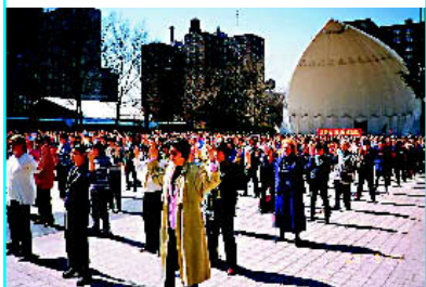
New York, 1999