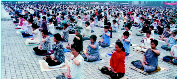
Over 10,000 people practicing Falun Gong during a sports festival in northern China in 1998.

In 1992, when Falun Gong was introduced to the public in China, it was well received. In both 1992 and 1993, Falun Gong was named the Star Qigong school and Master Li Hongzhi, the founder, was warmly supported by the Chinese authorities for significantly improving people's health and upgrading morality in society.