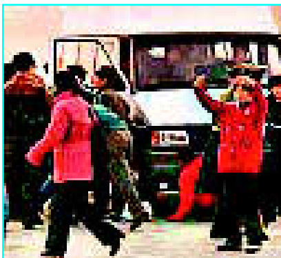
Calmly practicing amid arrests.