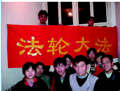
Smile for the journey ahead. This photo was taken before the practitioners went to Tian An Men Square in Beijing. Most of them were arrested afterward.