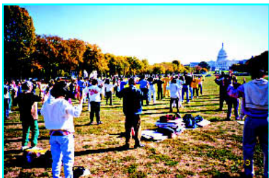
Washington DC, 1998

should always display compassion and kindness towards others and think of others before doing anything."