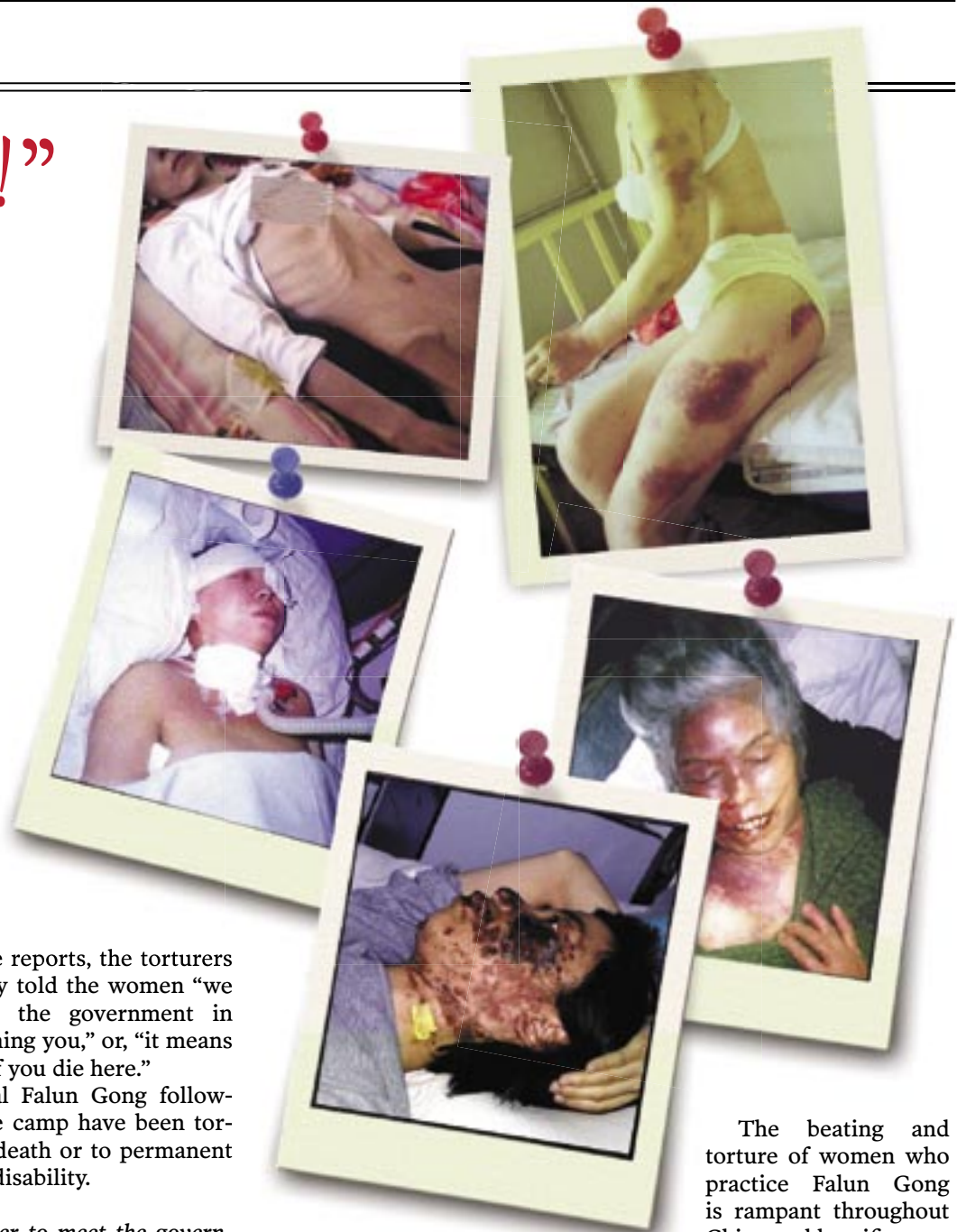
The beating and torture of women who practice Falun Gong is rampant throughout China and horrific.

The daily techniques used at the Dalian Reeducation Camp go beyond the above to include “reeducation” videos denigrating Falun Gong played around the clock, sleep deprivation, freezing, beatings, burning, force-feeding torture, and electric-shock torture.