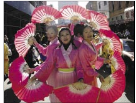
Traditional fan dancers in formation