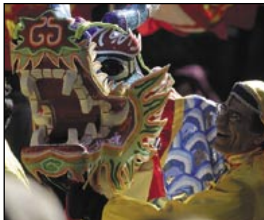
Preparing for the dragon dance