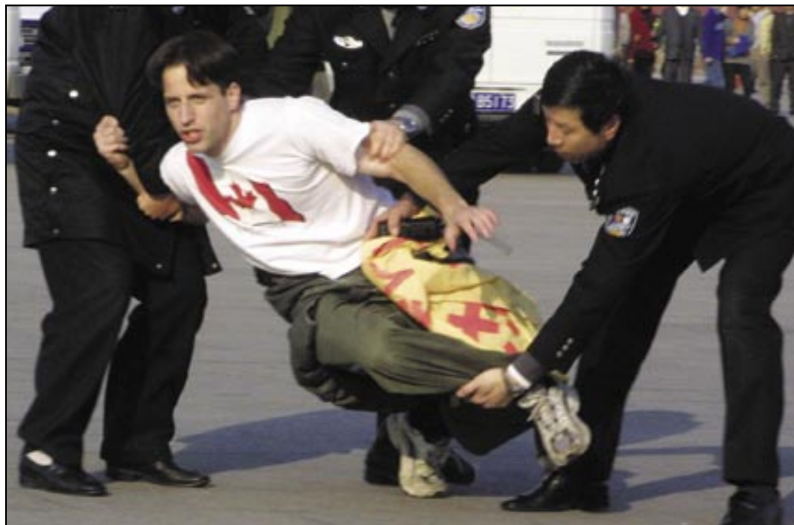
A Canadian Falun Gong practitioner is tackled to the ground. He was one of 35 Western practitioners who travelled to Beijing in 2001 to draw world attention to the persecution of Falun Gong.

For the next few days they followed me everywhere I went - to