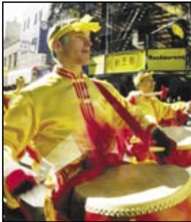
Chinese-style waist drum troupe

Chen and others explain that their performances in parades and festivals (Chen plays the flute) give