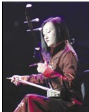
Playing the Chinese Erhu